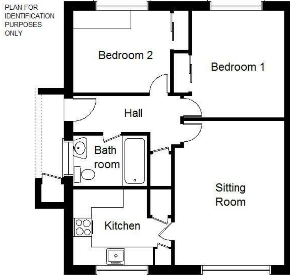
3 TREWIDDEN COURT, TRURO APPROX GROSS INTERNAL FLOOR AREA: 58 SQ METRES/623 SQ FT